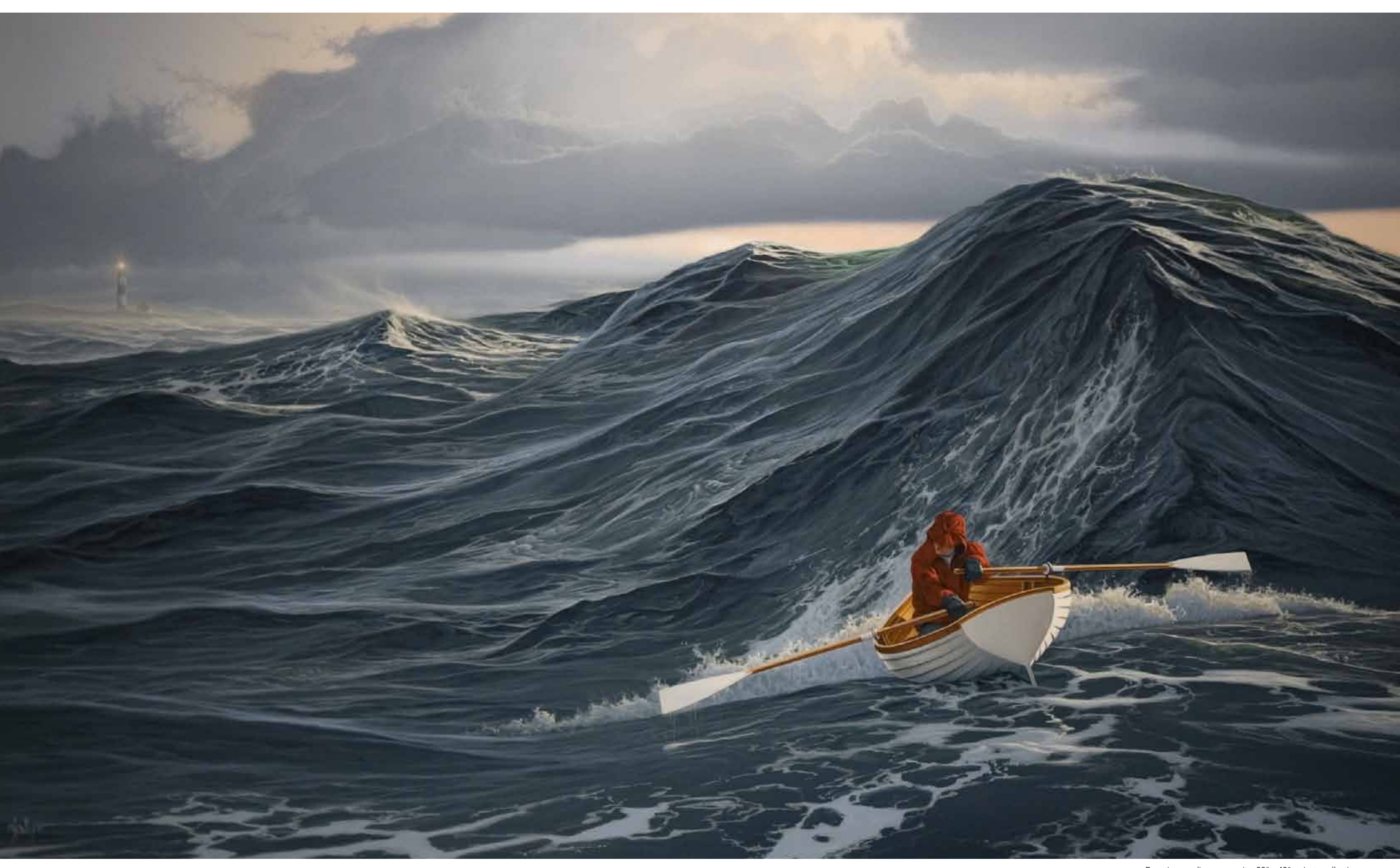
Devotion, acrylic on masonite, 30" x 48", private collection