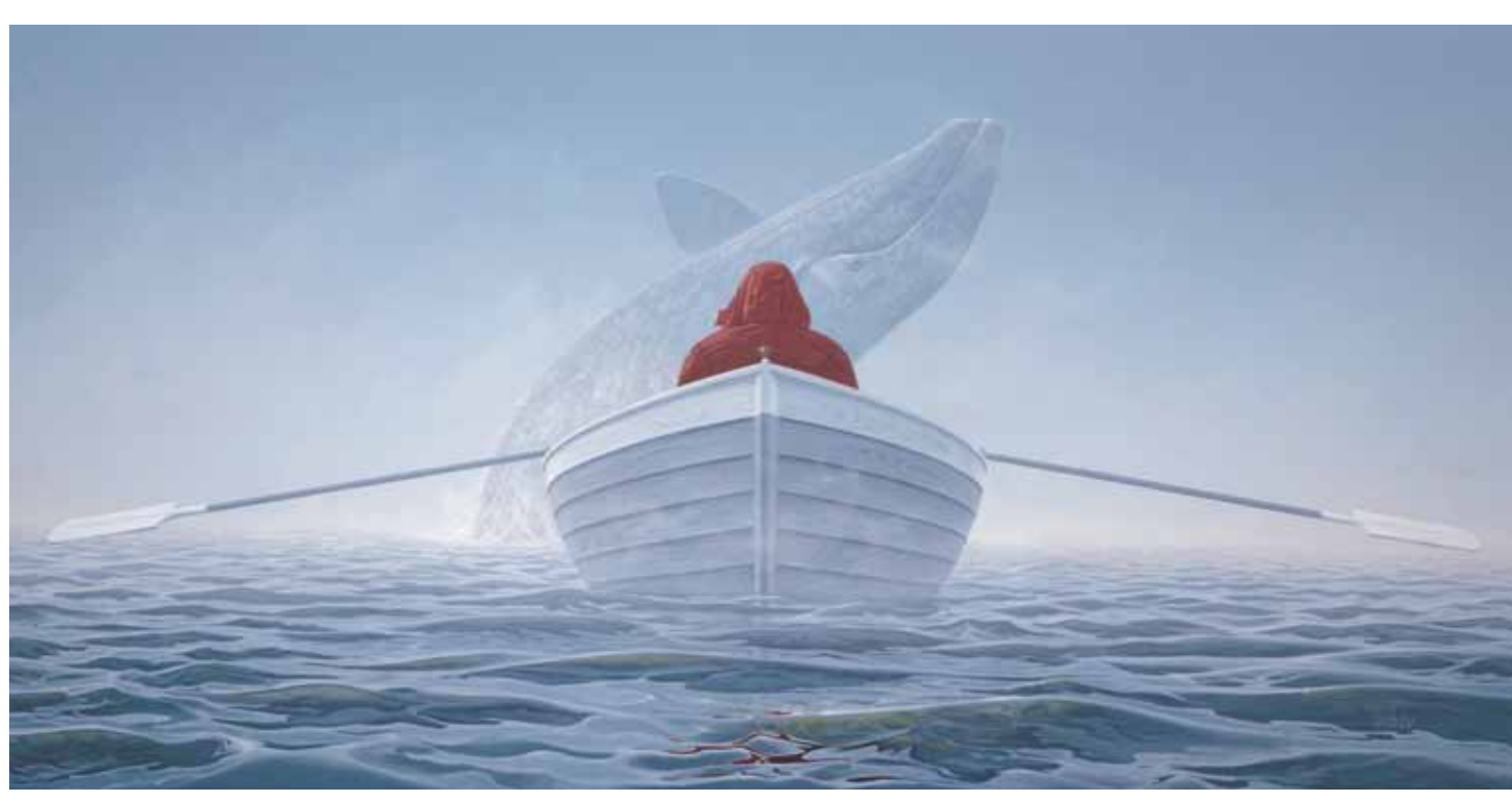
previous spread, Barometer, acrylic on masonite, 24" x 36", private collection above, Balance, acrylic on masonite, 24" x 48", private collection right, Acceptance, acrylic on masonite, 24" x 40", private collection