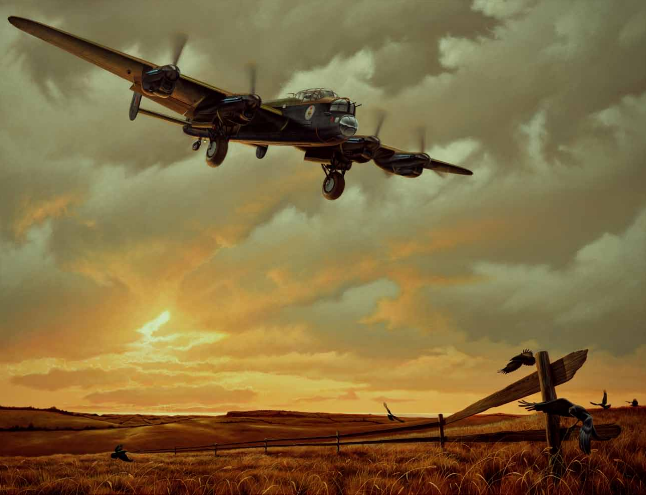
Heritage, acrylic on masonite, 36" x 48", private collection

many Lanc sorties were carried out at night and the pilots usually returned home at daybreak. I dedicate this painting to my Grandfather and the many young men who died flying the planes."