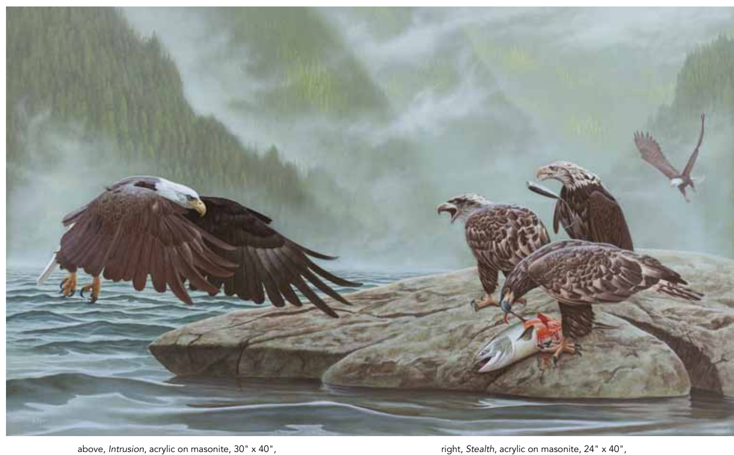
above, Intrusion, acrylic on masonite, 30" x 40", private collection