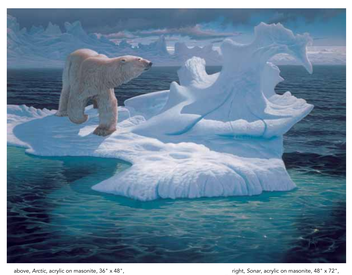
above, Arctic, acrylic on masonite, 36" x 48", Collection of Environment Canada

Collection of Depatment of Fisheries and Oceans