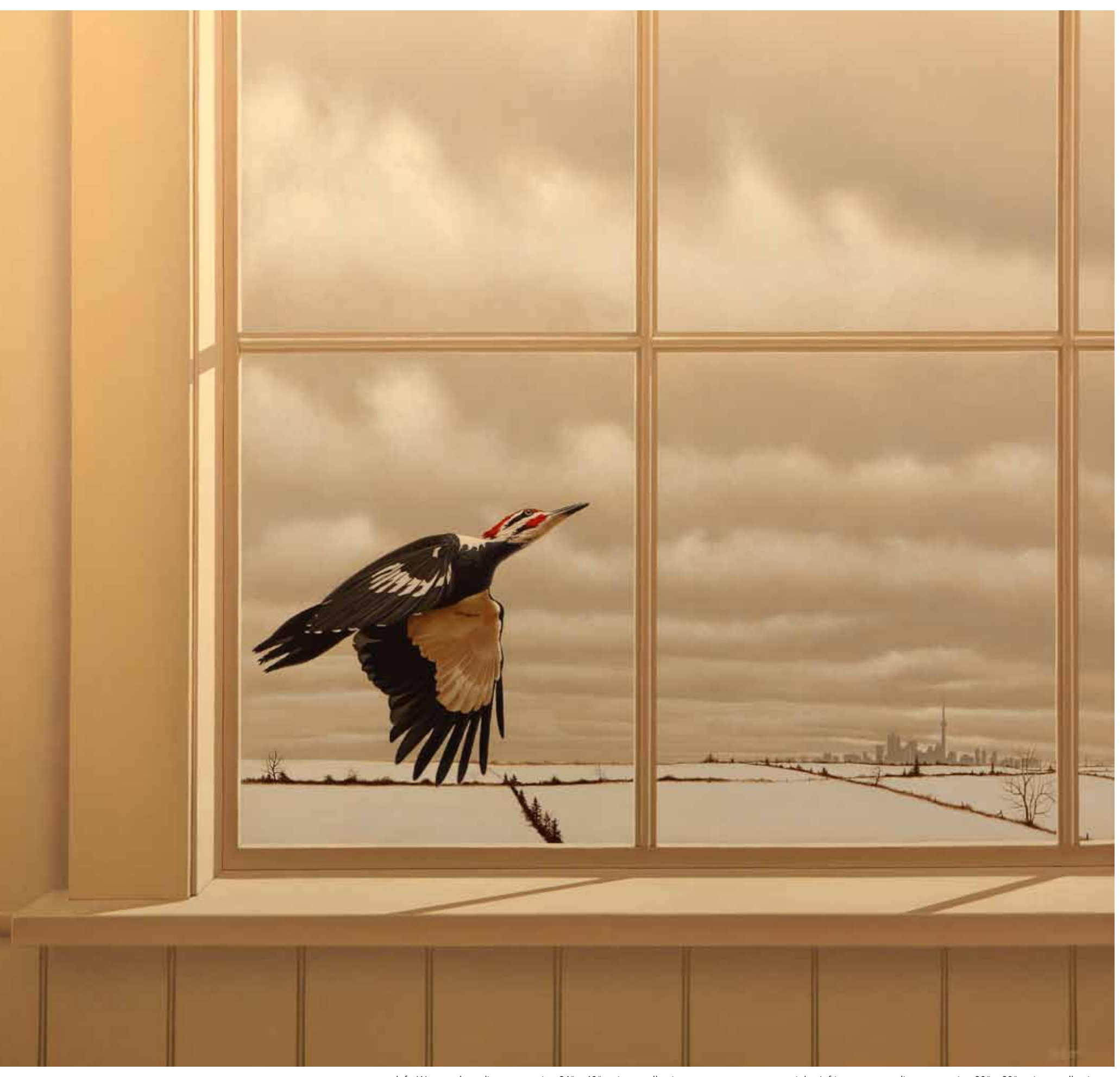
left, Westward, acrylic on masonite, 24" x 48", private collection